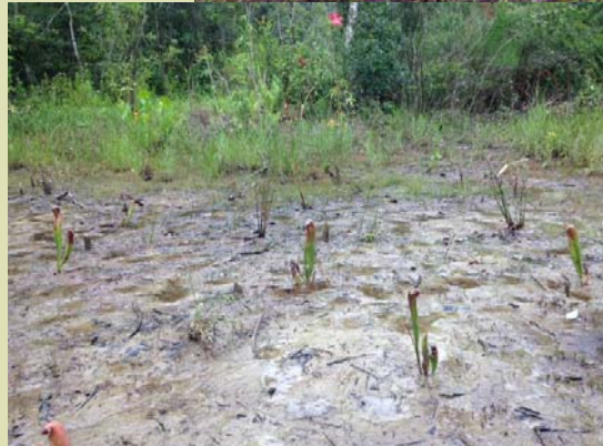
Results of volunteer work in an Arboretum freshwater marsh restoration area