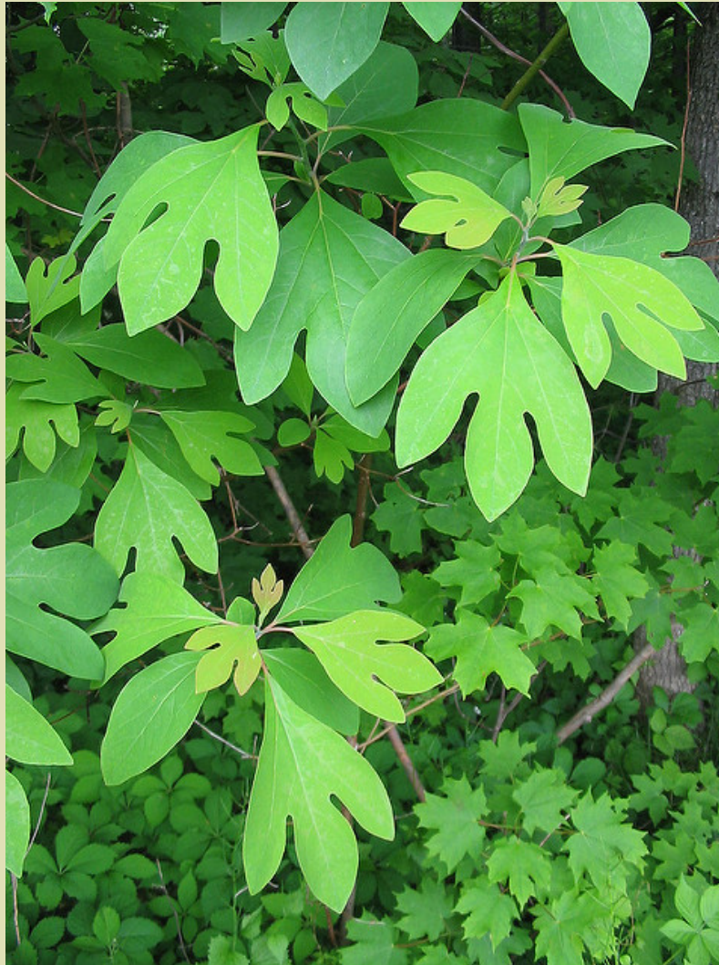
Photo courtesy of Kerry Wixted. The license for use can be found here https://creativecommons.org/licenses/by-nc-sa/2.0/legalcode