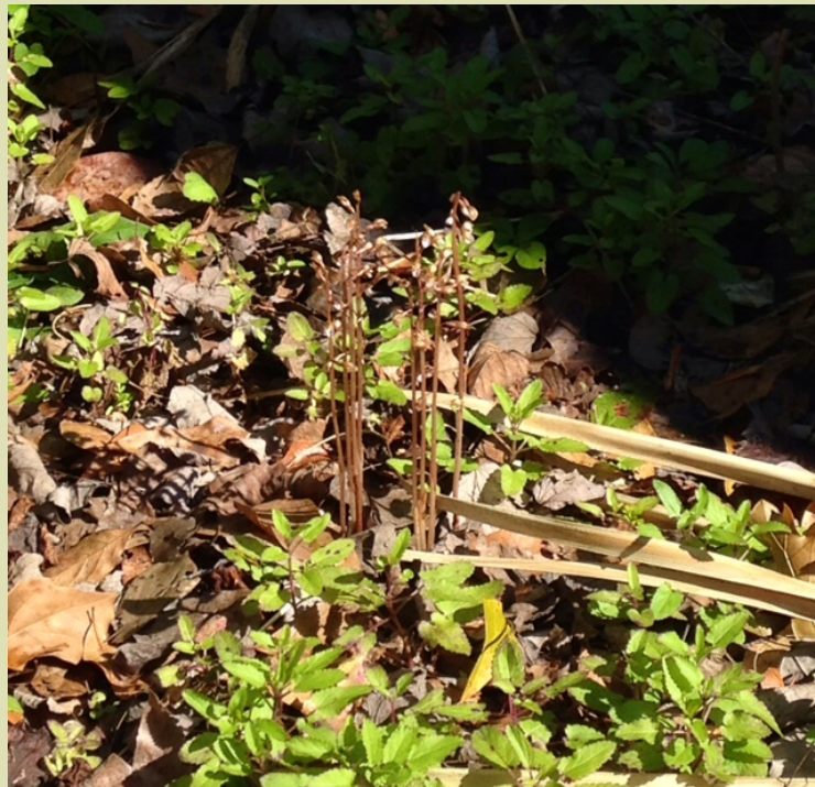
Coral root orchid ( C. wisteriana)

Congratulations to all of the families who have Stepped UP for Step Out In Nature.