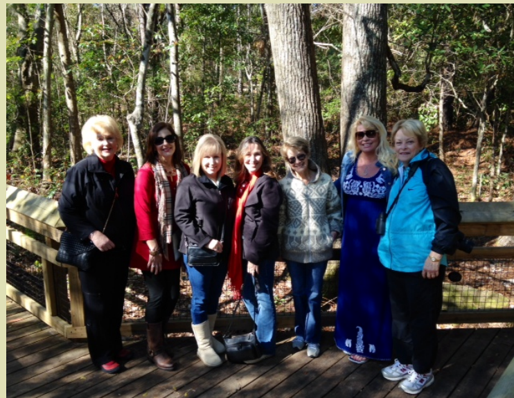
The Queen's Harbour Garden Club courtesy of Melinda Simmons

orchids have tiny, dull-colored flowers unsuitable for corsages or potted plants. Over 20,000 orchid species grow in forests, grasslands, swamps, deserts, and even range above the Arctic Circle, on every continent except Antarctica. Over one hundred species are native to Florida, a few of which grow on tree branches, but most grow in the ground. One such native orchid was spotted at the Arboretum in early February, the spring coral root ( Corallrhiza wisteriana ). This is a fairly common orchid that ranges through most of Florida and much of the United States. Against the background of dead leaves on the forest floor, most people do not even notice the brown stalks of this leafless orchid. With a magnifying glass, you could see that its short-lasting small brown flowers have white lips with tiny purple spots. These are replaced soon by seed pods and then the plants disappear until next year.