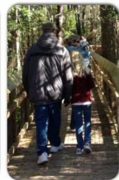
Step Out In Nature