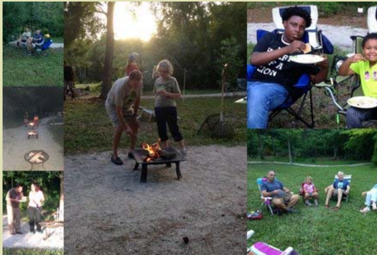
Members & volunteers enjoying the May Nature at Night event

Arbor-EAT-um Saturday, October 17 3 PM-6 PM