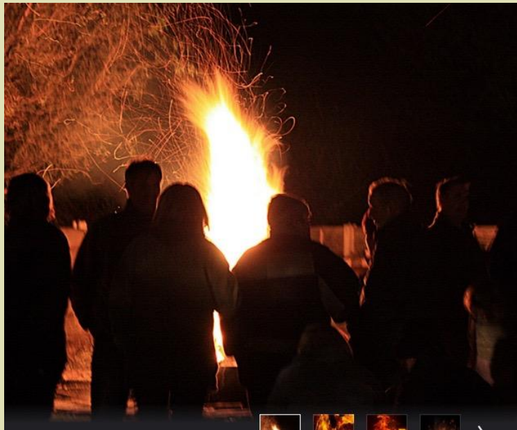
Photo courtesy of Ian Carroll. The license for use can be found here http://creativecommons.org/licenses/by/4.0/legalcode