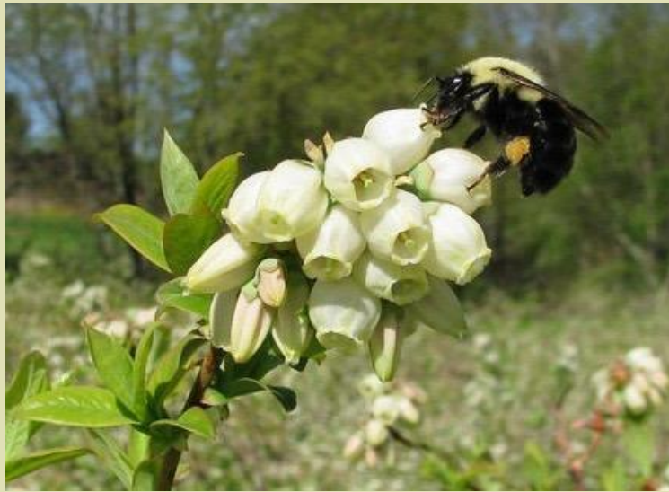
Photo courtesy of the USDAgov. The license for use can be found here

supervising all the workdays and performing the heavy equipment work at cost. Finally a salute to JEA, Rotaract, and our own site ops volunteers who together supplied close to 150 volunteer hours on the project. This was truly a community effort. We hope our visitors enjoy easier access to the Jones-Creek-bottomland forests.